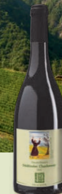
CHARDONNAY Südtirol-Alto Adige DOC

NAME: Südtirol-Alto Adige Weissburgunder Prackfol DOC GRAPE VARIETIES: Pinot Blanc YIELD PER HECTARE (hl): 65 TOWNSHIP: Völs am Schlern, Südtirol, Dolomites ALTITUDE: 700m GRADIENT (%): 50-70% EXPOSURE: South-South-West