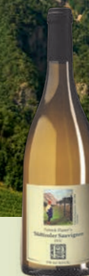
SAUVIGNON Südtirol-Alto Adige DOC

NAME: Südtirol-Alto Adige Chardonnay Prackfol DOC GRAPE VARIETIES: Chardonnay YIELD PER HECTARE (hl): 65 TOWNSHIP: Völs am Schlern, Südtirol, Dolomites ALTITUDE: 550-650m GRADIENT (%): 50-70% EXPOSURE: South-South-West