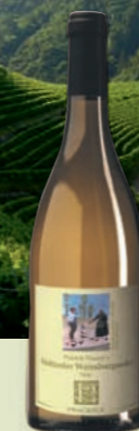
PINOT BLANC Südtirol-Alto Adige DOC

NAME: Südtirol-Alto Adige Weissburgunder Prackfol DOC GRAPE VARIETIES: Pinot Blanc YIELD PER HECTARE (hl): 65 TOWNSHIP: Völs am Schlern, Südtirol, Dolomites ALTITUDE: 700m GRADIENT (%): 50-70% EXPOSURE: South-South-West